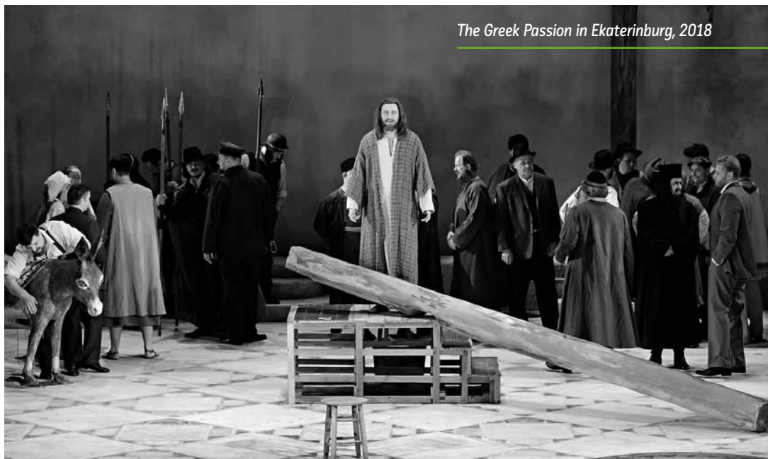
The Greek Passion in Ekaterinburg, 2018

OD · We wanted to find an opera that would address a current theme – that would portray something which happened in the past, which still occurs in our time and may well be important in the future. The Greek Passion is really the continuation and culmination of a loose trilogy. The theme of Glass' Satyagraha is peace and the capacity of one individual to influence large numbers of people, a whole state or society. That individual is Mahatma Gandhi, who brought the British Empire in India to its knees by non-violent means, and who, in the same manner, managed to save Indians in the Republic of South Africa from the widespread