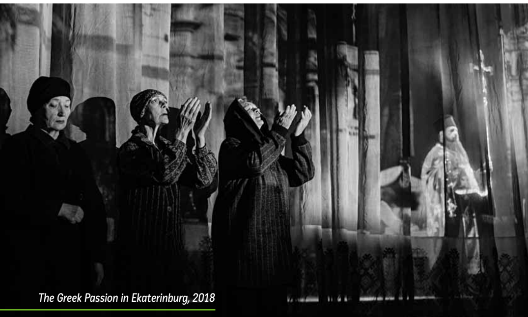
The Greek Passion in Ekaterinburg, 2018

The Greek Passion deals not only with a conflict between two representatives of the church, but above all with the struggle between good and evil within each of us. In the opera, events play out which are almost a hundred years old, but we can still see the same things happening around us. Whether it's in Syria or elsewhere, masses of forced refugees are dying on the borders of Europe right now. That's why we chose Martinů's Greek Passion . I decided on the first "London" version, which of course has a libretto in English only. A production in English would have been difficult to understand and