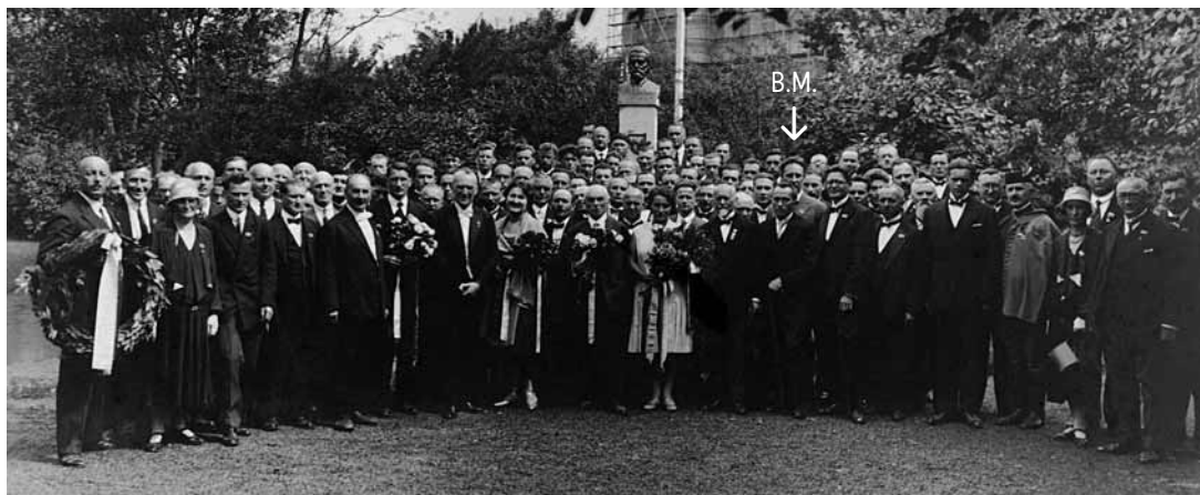
B. Martinů after the opening of the Tyl House, Polička, 1929

At that time, in the summer of 1933, he was working intensively on the opera The Plays of Mary ,