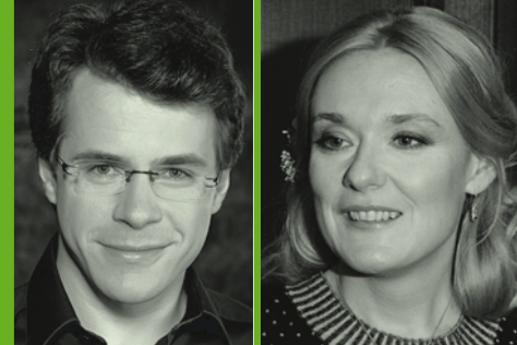
Jakub Hruša, President of IMC